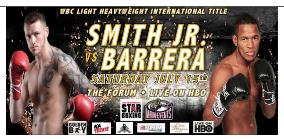
NEW YORK, JUNE 28, 2017: FOR IMMEDIATE RELEASE